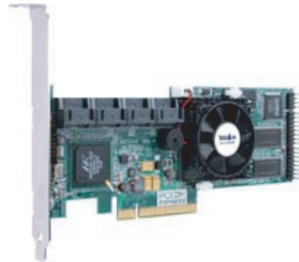
PCI-Express to SATA II RAID Controllers

Server performance and 64-bit power come together in the form of Tyan's Thunder K8SE (S2892), a dual AMD Opteron™ processor motherboard for intensive computing applications. Using the capabilities of the highly-scalable AMD64 processor design coupled with NVIDIA's nForce Pro core-logic, and an industry-leading Direct Connect Architecture, the Thunder K8SE delivers features such as dual Gigabit Ethernet and single 10/100 LAN ports, dual PCI Express x16 (one x16 and one x4 signal), and three PCI-X slots, support for up to eight (8) Registered DDR400/333 memory modules, integrated server video, built-in Serial ATA-II NVIDIA RAID, TARO™ storage add-on card support, and remote management option all provide customers with the ability to do more and reach higher potentials in their server applications.