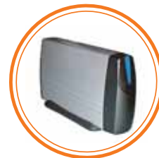
External Drives FireWire, SCSI, USB 2.0

ThinkCP • 16812 Hale Avenue • Irvine, California 92606 • Toll Free: (800) 726-2477 Phone: (949) 833-3222 • Fax: (949) 833-3389 • www.ThinkCP.com • SalesDesk@ThinkCP.com