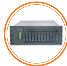
JBOD & RAID Systems