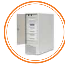
SAN & NAS Systems