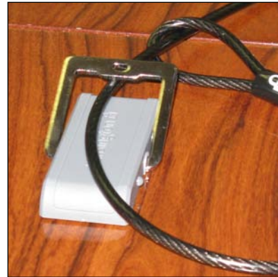
Anchor Lock Assembly