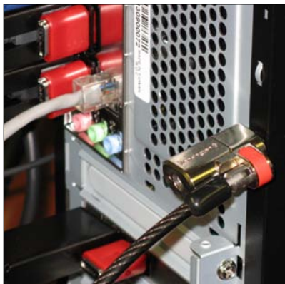
Rear Assembly with "Anchor Lock" (Sample Setup Using FEDS-SGARD 1)