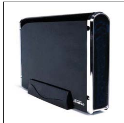
External FIPS 140-2 Hard Drive (Optional)