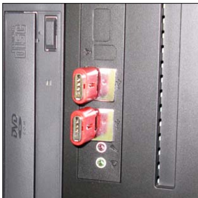
USB Front-Side Blocks & Optional CD/DVD ROM (Sample Setup Using FEDS-SGARD 1)