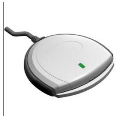
Internal or External Card Reader (Optional)

For More Information On This Product Please Call Toll Free (800) 726-2477