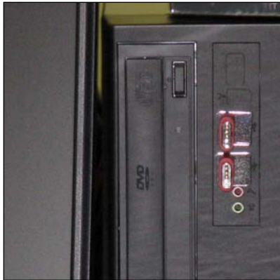
Rear Device Locks & USB Port Blocks (Sample Setup Using FEDS-SGARD 1)